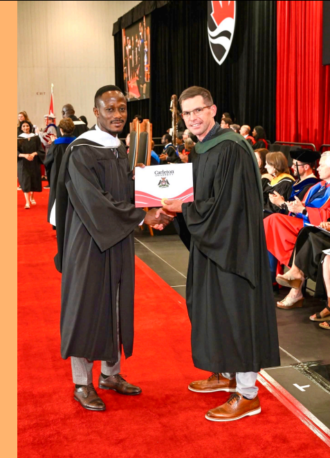
Master of Arts in Economics, Specialization in Data Science Carleton University, Class of 2025