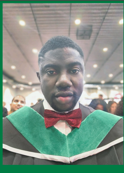
Master of Applied Business Analytics Carleton University, Class of 2025